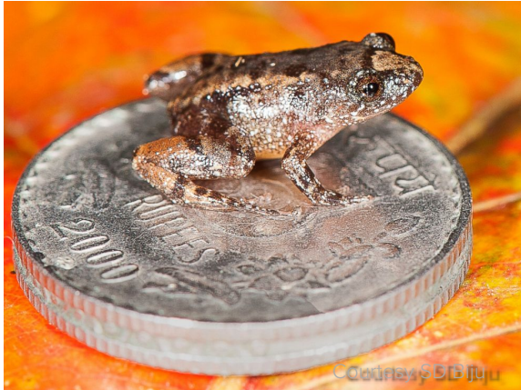
The Robinmoore's Night Frog ( Nyctibatrachus robinmoorei ) sitting on the India