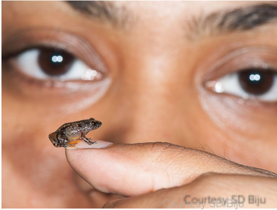
Vijayan's Night Frog ( Nyctibatrachus pulivijayani ), a miniature-sized frog discov